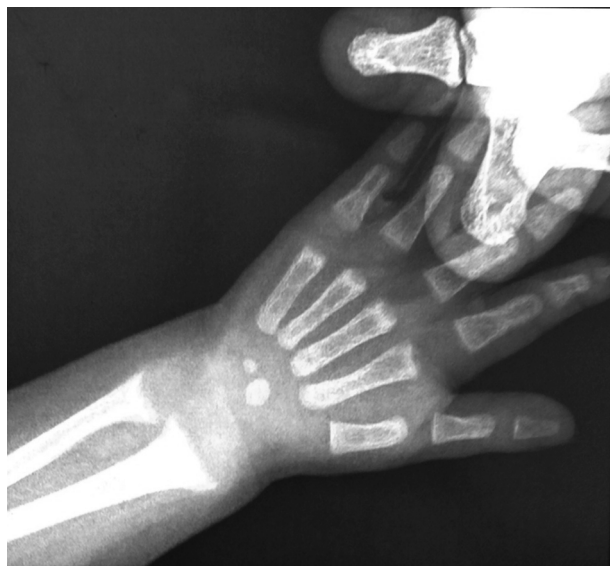
Figure 4. X-ray of the wrist region

ity that this heritable disease could explain her refractoriness toward vitamin D therapy. Her other laboratory results showed normal blood gases, BUN and Creatinine, while her pituitary function results were compatible with isolated GHD, with the other hypophyseal hormones being within the normal ranges (Table 2).