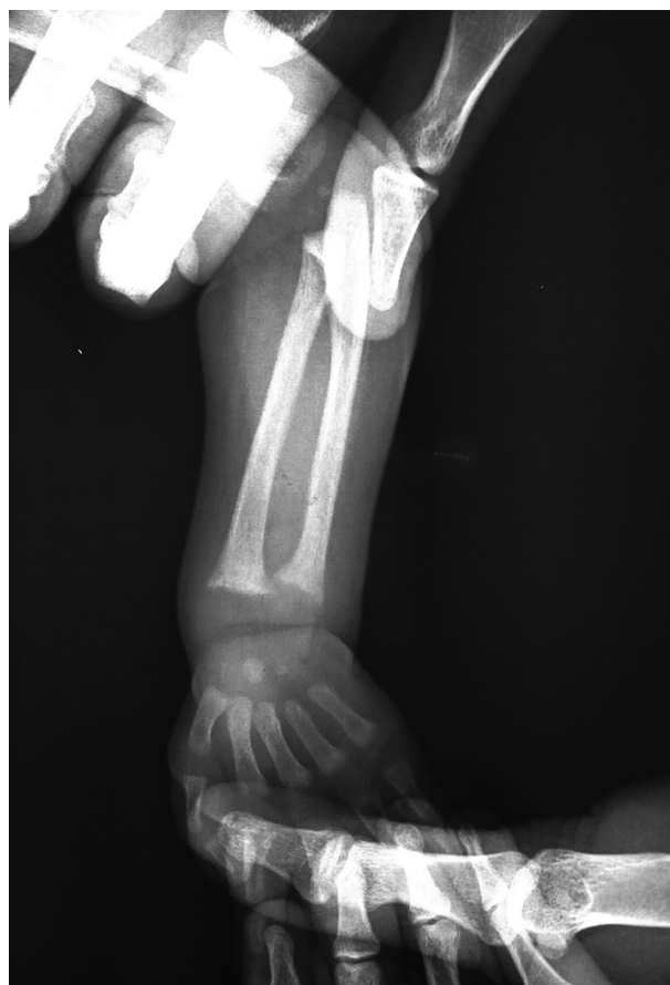
Figure 5. X-ray of the wrist region

Familial Hypophosphatemic Rickets (FHR), classically called vitamin D resistant rickets, due to its refractoriness to vitamin D therapy while clinically mimicking nutritional rickets, is the most common heritable rickets. It is often misdiagnosed as nutritional rickets, metaphyseal dysplasia and physiologic bowing (2). Although the most apparent abnormality is renal phosphate wasting, due to reduced expression of sodium-phosphate cotransporters