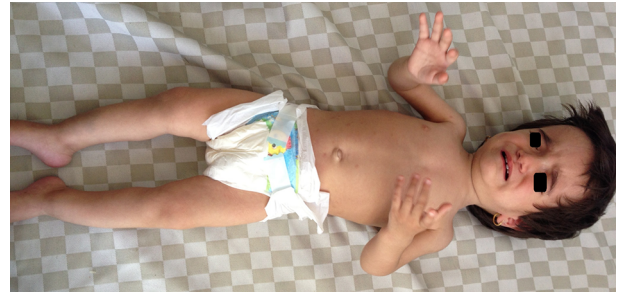
Figure 2. A 19-Month-Old Girl Patient

Our patient did not have any problems until 6 months of age, when gradually she was noticed to have growth delay, on regular monthly neonatal checkups. She was referred to a secondary center when she was 1 year old. She was diagnosed with nutritional rickets and vitamin D therapy, with a dose of 300000 units, was instituted for her, which did not turn out to be effective. Finally, she was referred to our clinic, when she was 18 months old. From a neurodevelopmental viewpoint, she was still unable to walk. According to the parents, she had no head lag at 4 months, was able to sit without support at 6 months, and able to stand at 18 months. Although she could pronounce DaDa, she was still unable to say any word. She had no history of vomiting and diarrhea. Her weight, height and head circumference were 6700 g, 66 cm and 46 cm, respectively, which were in the 0.1, 0.1, 27.8 percentiles with Z scores of -5.7, -4.7, -0.6 (Seca, Hamburg, Germany), respectively (Table 1). On physical examination, she had an apparent short stature for her age, which, together with her facial features, including prominent forehead, depressed midface and relatively small ratios, raised the suspicion of growth hormone deficiency (GHD) (Figures 2 and 3). Her tibia and fibula regions seemed a bit bowed and subtle rosaries were apparent on her costochondral junctions, she had normal genitalia.