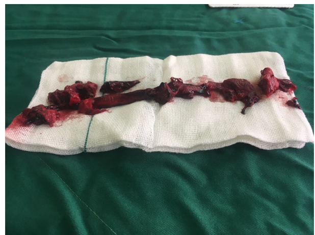
Figure 2. Thromboembolism removed from the left and right pulmonary arteries by heart surgery

Gradually, in the next 48 - 72 hours, the medications were tapered off, and the patient was weaned from the ven-