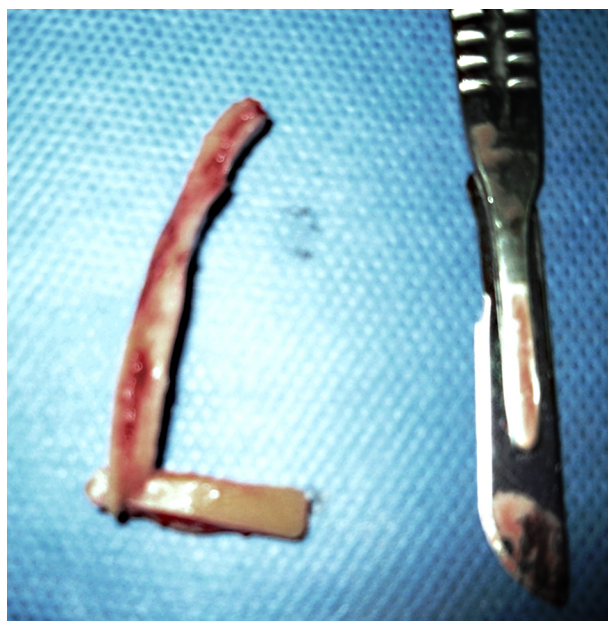
Figure 2. L-Shaped Bone Graft From Calvaria

follow-up, although this method has its own drawbacks, such as a stiff nose tip (19). A split calvarial bone graft was the most commonly used bone for the reconstruction of a saddle nose deformity. It is used in augmentation rhinoplasty for Asian patients, reconstruction of the nose in cleft lip/palate patients, and in revision rhinoplasty after an overzealous reduction of the nasal septum (20-22). It is a thin bone; therefore, in cases requiring a thick bone, a full-thickness cranial bone harvest should be considered, or sources like anterior iliac bone should be used (23). In situations in which neurosurgeons have recently elevated a bicoronal flap and have carried out a craniotomy, they will not allow the same flap elevation in near future, in accordance to the result of the study that showed that monocritical block harvesting from the parietal bone significantly decreases the skull's strength (24). In this situation, other sources of autogenous bone grafting should be sought. Inferior turbinate bone, among the available donor bone sources in this article, has the least amount of bone, so it is useful for the correction of mild-to-moderate saddle nose deformity (25). In trauma patients in whom maxillary down-fracturing for mobilization of the fractured maxilla is in the plan, it provides excellent access to the both inferior turbinates.