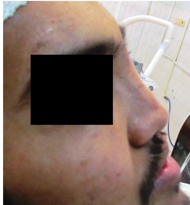
Figure 4. Obliteration of the Nasofrontal Angle After a Split Calvarial Bone Graft for the Correction of Saddle Nose Deformity

6) NOE fracture has nasal component that is very simi-