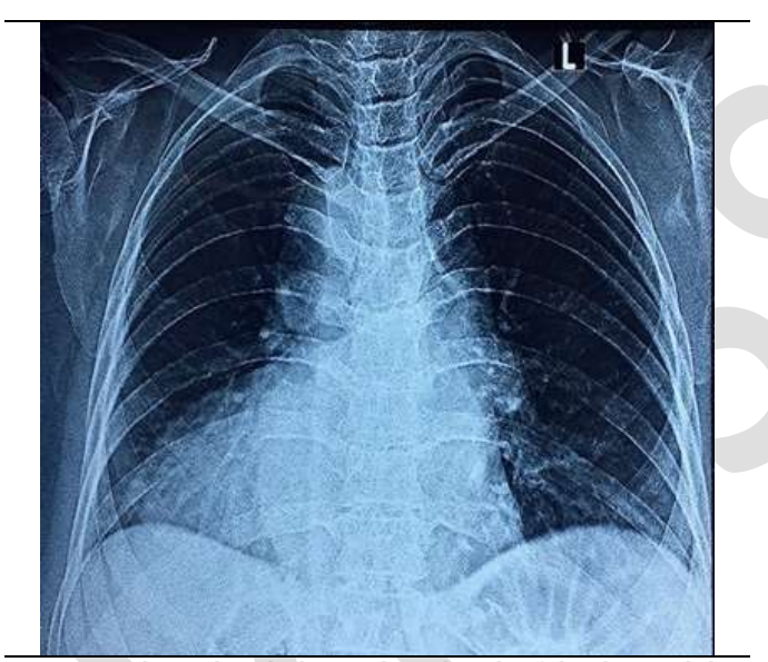
Figure 1. The cardiac shadow in the right side of the chest and the gastric bubble under the right dome of the diaphragm could be seen on a chest X-ray.

were doubly clipped separately and divided after accurate dissection of the Calot triangle and critical of safety view achievement. The gallbladder was normally removed from its bed by electrocautery and, under direct vision, extracted in a retrieval bag via the camera port. The first operation (52-year-old woman) lasted 75 minutes and the second operation (64-year-old woman) lasted 30 minutes using the same method. On postoperative day 1, patients had an uneventful postoperative period and were discharged.