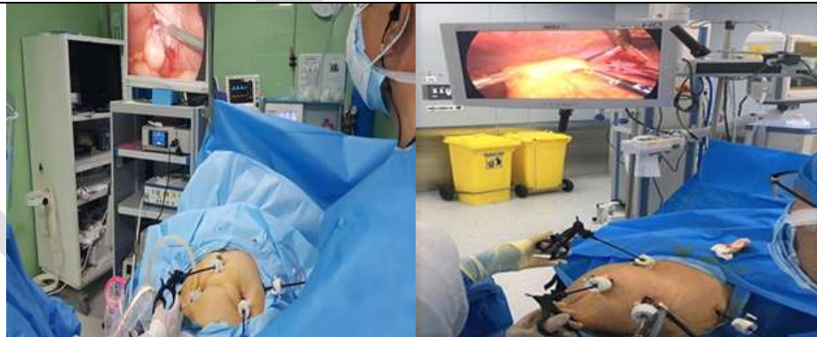
Figure 2. The Operating room equipment and port placement.