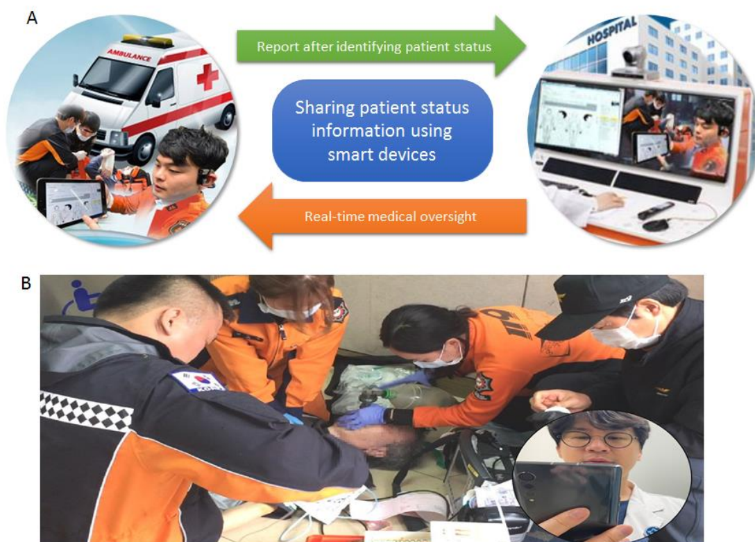
Figure 1. Graphic concept (A) and actual capture image (B) for smart advanced life support. The SALS is a field advanced resuscitation by paramedics with video communication based direct medical oversight. All medical oversights were performed by an emergency medical practitioner

There was no difference between the two groups regarding the EMS response time and transport time intervals. Since ALS was implemented in the scene, from arrival at the scene to departure, the time interval increased from 9.0 (median, 4.0-10.0) min to 27.0 (median, 21.0-33.0) min ( P<0.001 ). On the other hand, the time interval of the EMS arrival to first ROSC was 22.0 (median, 14.0-37.0) min in the SALS group that was shorter than that in the BLS group (29.0 min; median, 18.0-46.0) min ( P<0.001 ). Prehospital ROSC rate in the SALS group was higher