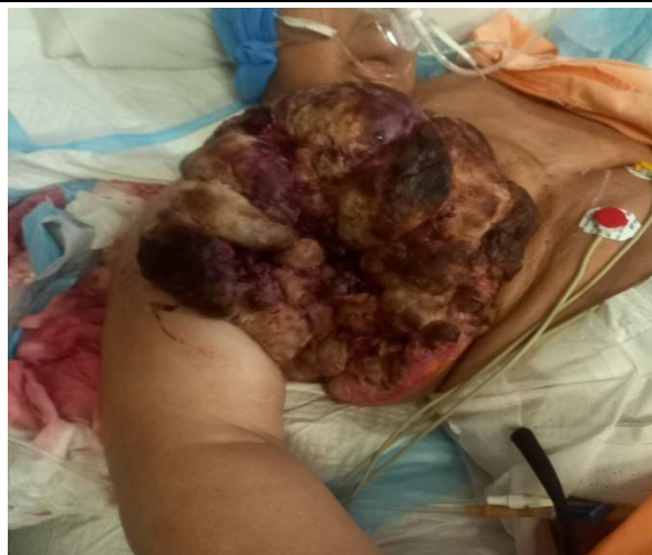
Figure 1. A patient with a cancerous lesion in the right breast

The main difference between this case and the two cases mentioned above was the recovery in the former. Nonetheless, in our case, the disease led to death, probably due to the conditions of the patient when she was admitted to the hospital. Since she had a history of two failed breast cancer operations in Afghanistan and Pakistan, and despite early diagnosis and treatment measures, the patient did not respond to treatment and died due to the severity of other various bacterial infections.