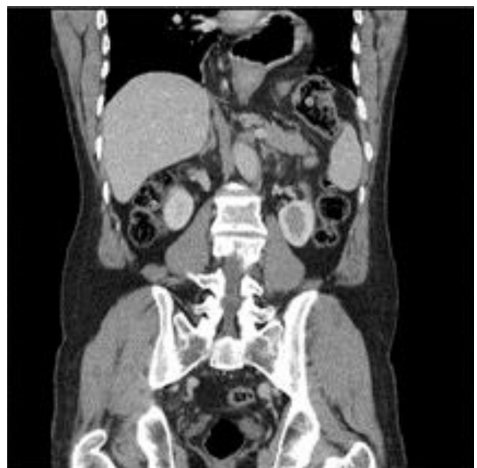
Figure 1. Axial and Coronal Images of the Hiatal Hernia on an Abdominopelvic CT