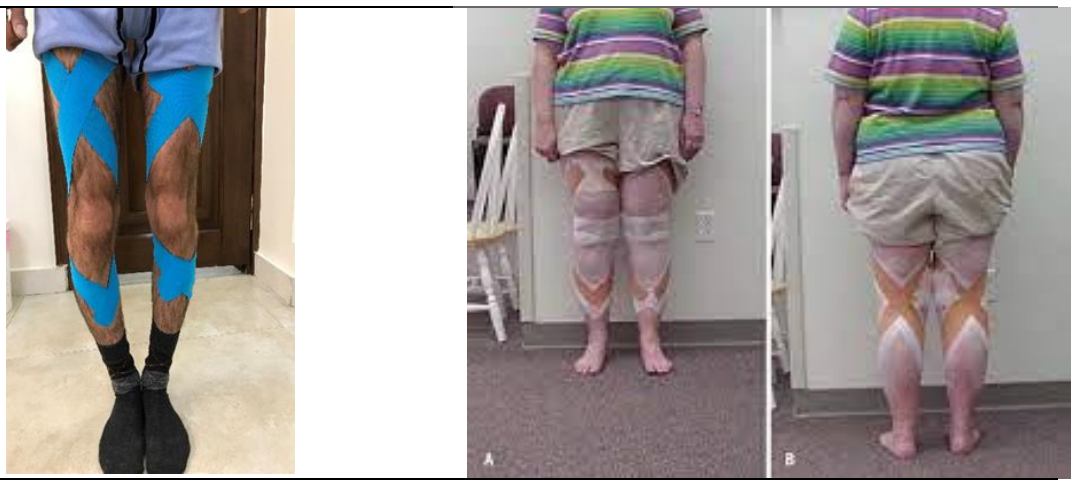
Figure 2. Taping to correct varus impairment

moving(4). The treatment period included 10 sessions conducted in six weeks. There were two treatment sessions during the first four treatment weeks, and during the other two weeks, there was only one treatment session for the patients (15). Each treatment session continued for 45-60 min (12). In all experimental sub-groups, the treatment protocols were as follows: Passive correction with taping (Figures 2 and 3), training and treatments inside the clinic, correcting the body alignment and functional activities (Table 1), and explaining the practices that should be carried out at home. A written instruction was also handed over to the patients(2).