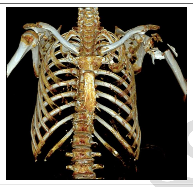
Figure 3. Three-dimensional reconstruction CT showing the intrathoracic displacement of humeral head and ribs fracture.