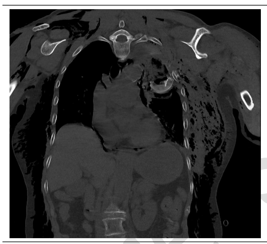
Figure 1. CT scan showing the intrathoracic localization of the humeral head.