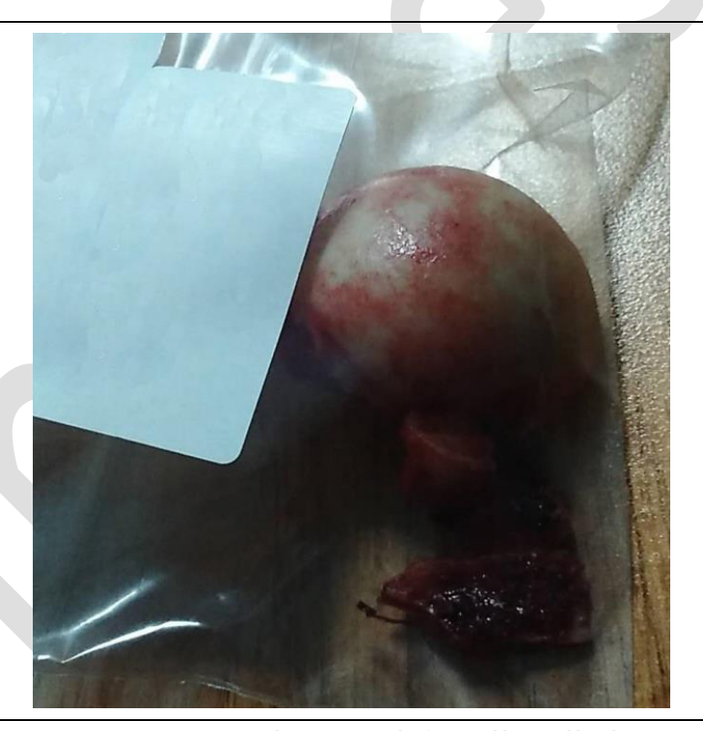
\textbf{Figure 4.} \ \textbf{Intra-operative picture demonstrating the fractured humeral head.}

nerve three weeks later. Therefore, the orthopedic surgery team performed reverse shoulder arthroplasty (Figure 5). The patient was being well after reoperation.