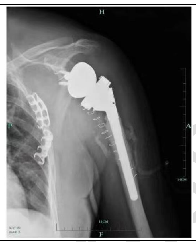
Figure 5. Postoperative radiographs of the reverse shoulder arthroplasty

final follow-up, the patient's shoulder was free from pain, and its range of movement (ROM) included 110^{\circ} flexion, 70^{\circ} abduction, 35^{\circ} external rotation, and 50^{\circ} internal rotation.