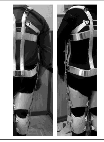
Figure 1. Thoracolumbosacral orthosis with an additional thigh and knee constraint

The ankle proprioceptive training included exercises on the ankle balance board with standing on two legs and the rocker board in both dorsal/plantar flexion and left/right directions for 10 consecutive days. The results of a study conducted by Akbari et al. revealed that 10 sessions are optimal for proprioceptive training (16). The pattern of training progression during the sessions was eyes open and head forward, eyes closed and head forward, eyes open and head back (hyperextension), and eyes closed and head back. Each exercise was performed 5 times, each taking 15 seconds with 45-second rest intervals. The intervention was provided based on the patient's development, as increasing the exercise duration and decreasing rest time by approximately 5