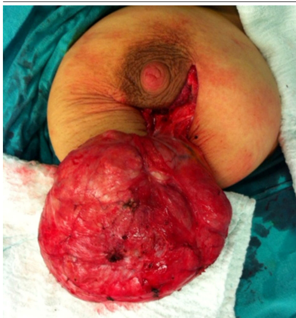
Figure 1. The Appearance of the Encapsulated and Lobulated Mass Excised by Surgery